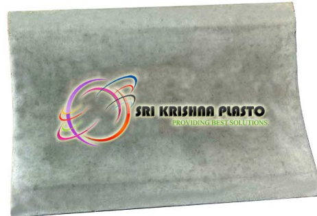
Saucer Drain Making Mould 410 x 600 x 100