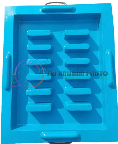
Rcc Drain Cover Making Mold 480mm x 380mm x 60mm