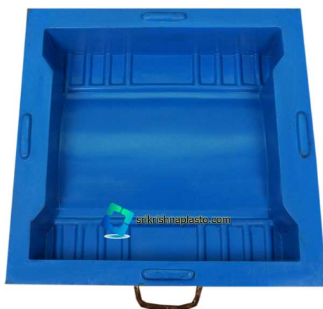
Drain Cover Fiber Glass Mould