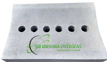
Saucer Drain Making Moulds 450 X 600 X 100