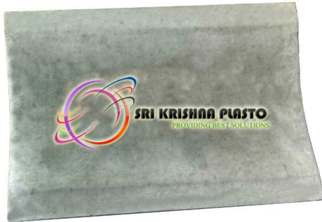
Saucer Drain Making Mould 410 x 600 x 100